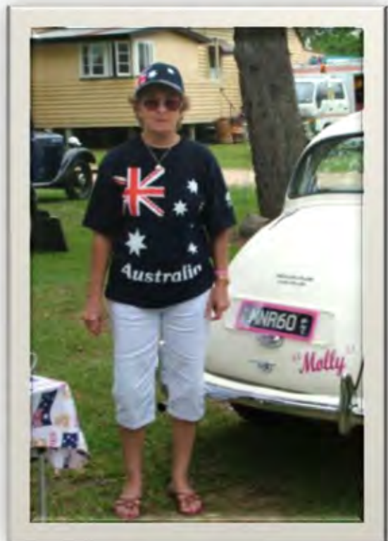
Australia Day at the hysterical village.